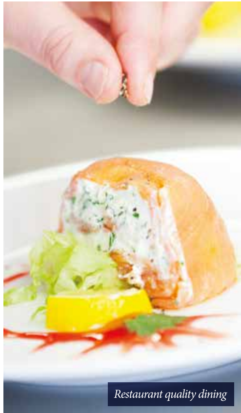
Restaurant quality dining