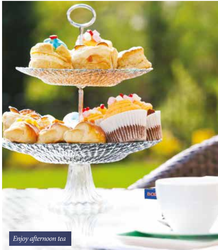
Enjoy afternoon tea

Our Head Chef works closely with residents to create delicious menus based on personal preferences and, naturally, we can cater for any dietary needs, too.